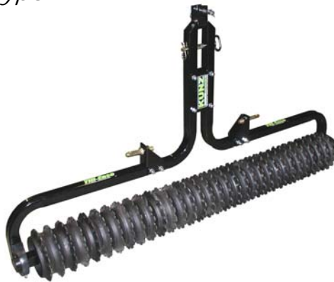
With 3-Point Kit