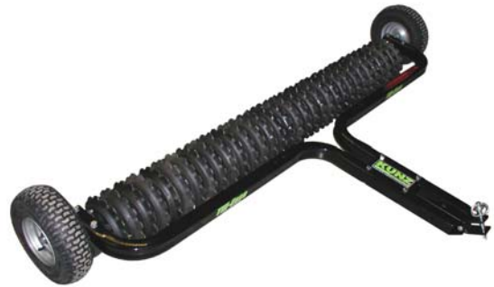
With Wheel Kit