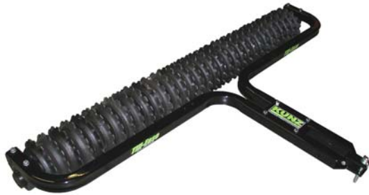
Standard Pull Type Base Unit